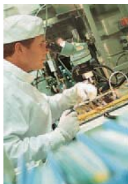
Clean room laboratories require reliable and precise gas analysis.

The CLD 88 nitrogen oxide analyzer is unique in its speed and precision. It makes possible the continuous measurement of NO concentrations even in the range of parts per trillion!